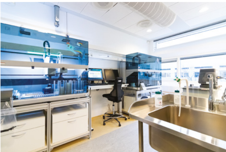
Freedom EVO platforms allow scientists at Christian Hansen to automate their inoculation and plating protocols

"We purchased two Freedom EVO platforms in 2015 and, since automating our workflow, we can run significantly more plates than we could have done manually," Christel added. "In 2018, we prepared around 25,000 plates; achieving this high throughput by hand